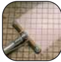
Tile & Grout Cleaning