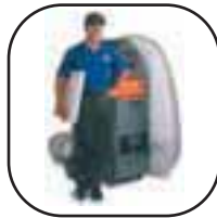
Air Duct & Dryer Vent Cleaning

*Minimum charge may apply. Call Coit for details. Offer expires 7/31/07