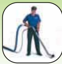
Carpet & Oriental Rug Cleaning